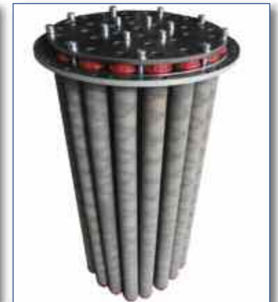
TME High Flow elements made of fiber glass

Our elements have a lifetime of several years; up to ten years & above