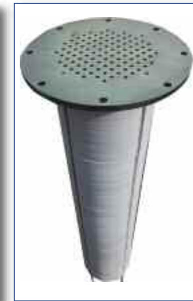
Transor Edge Filter with multi-channel geometry