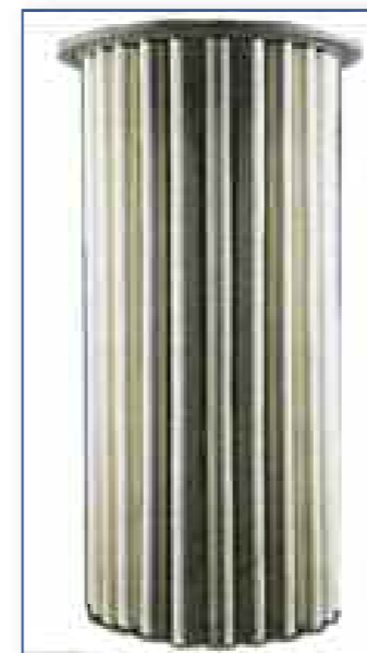
Transor Edge Filter